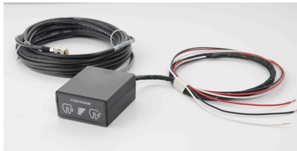
Figure 3: SmartLock display box