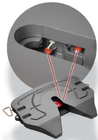
Figure 2: SmartLock fifth wheel